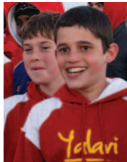
Yalari – Rosemary Bishop Indigenous Education Scholarship Program