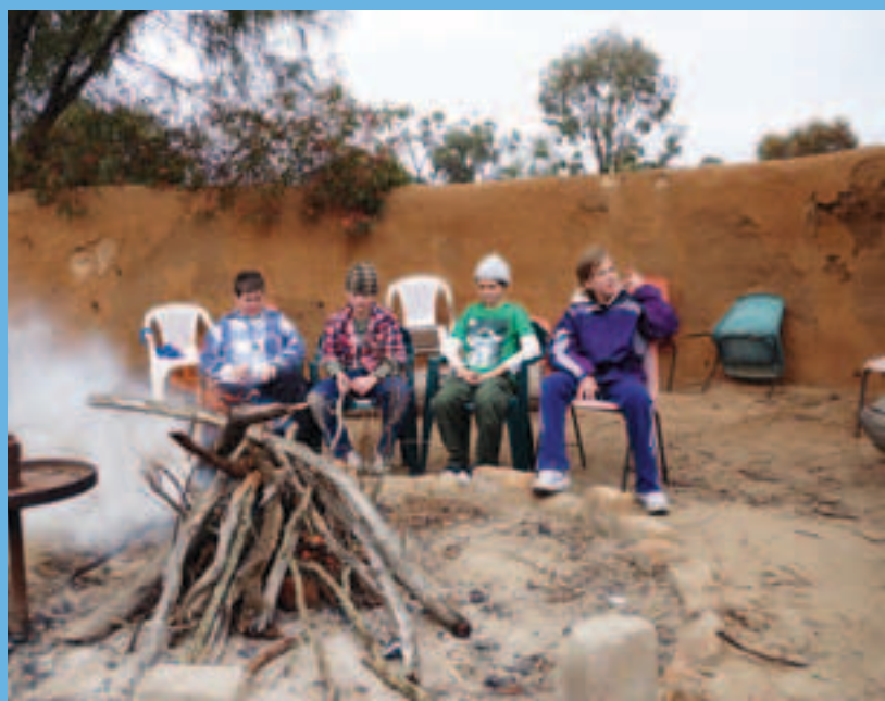
Right: Mallee Accommodation & Support Program (MASP) – School Holiday Program