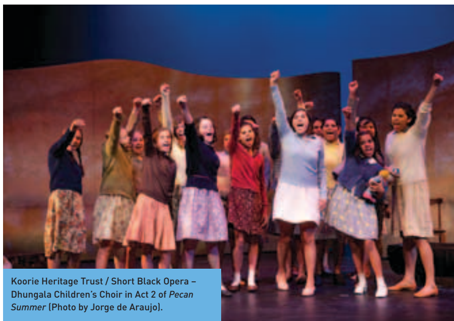
Koorie Heritage Trust / Short Black Opera – Dhungala Children's Choir in Act 2 of Pecan Summer (Photo by Jorge de Araujo).