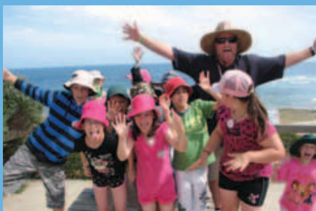
Above: Cottage by the Sea – REEF Camps