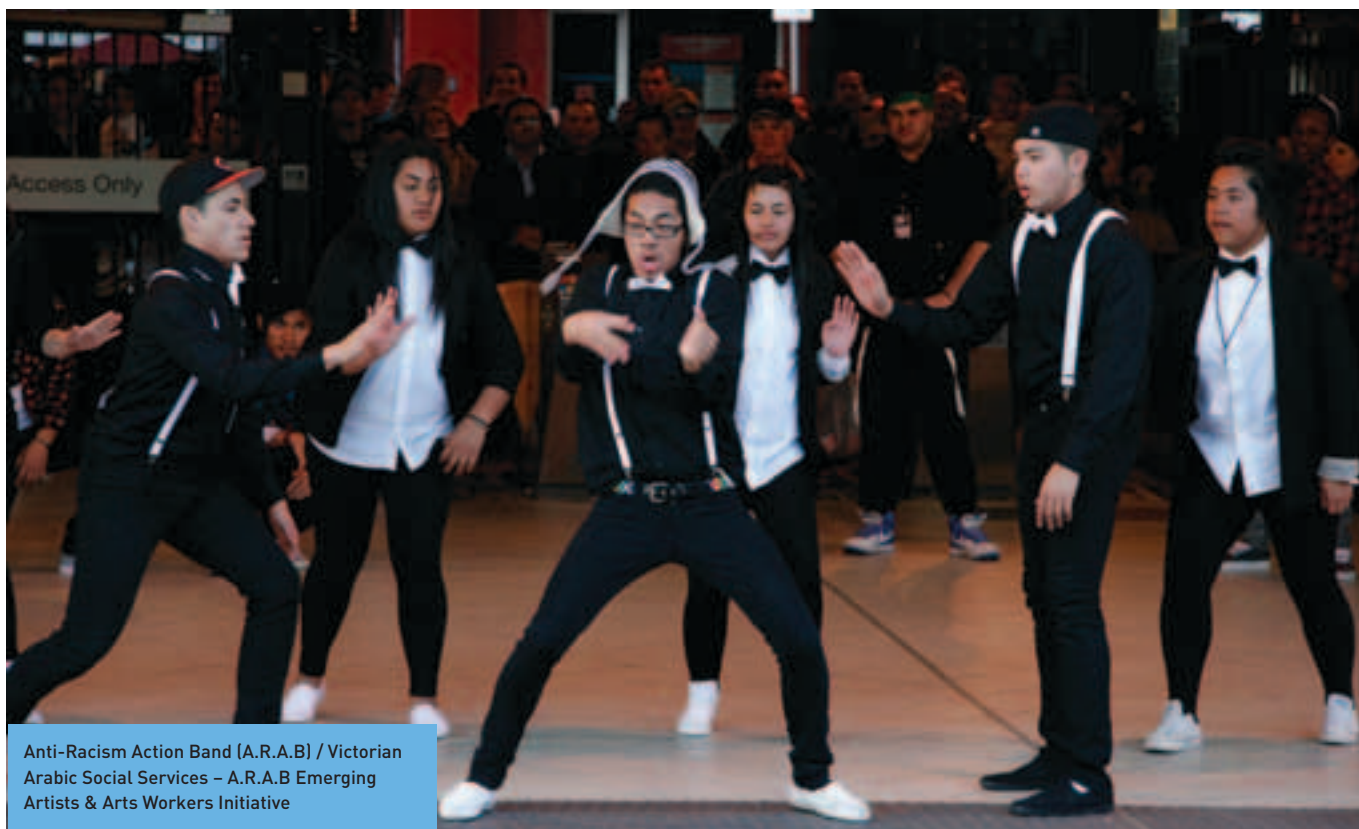
Anti-Racism Action Band (A.R.A.B) / Victorian Arabic Social Services – A.R.A.B Emerging Artists & Arts Workers Initiative