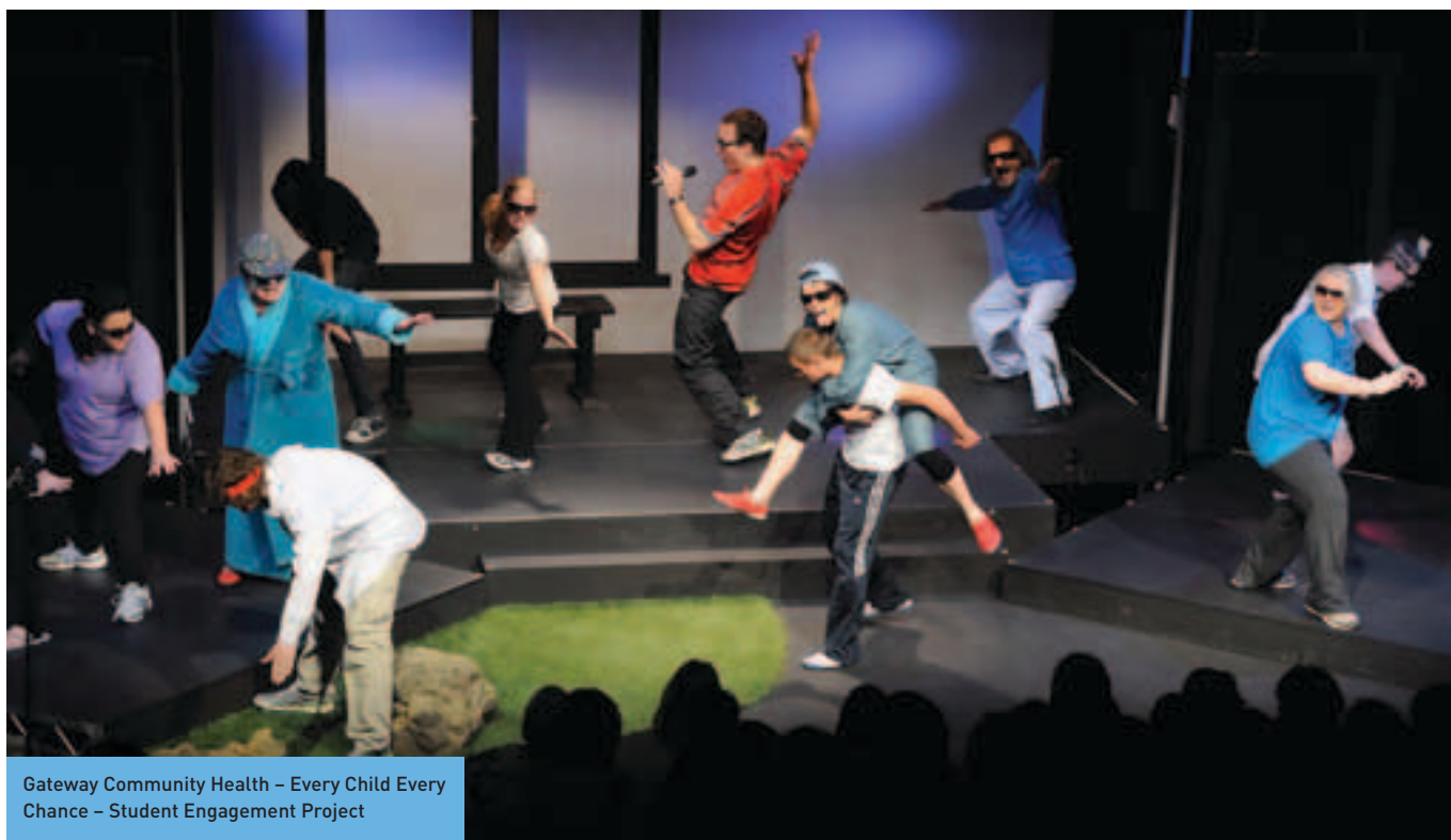
Gateway Community Health – Every Child Every Chance – Student Engagement Project