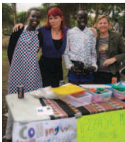
North Yarra Community Health – Spicy Cooking Program