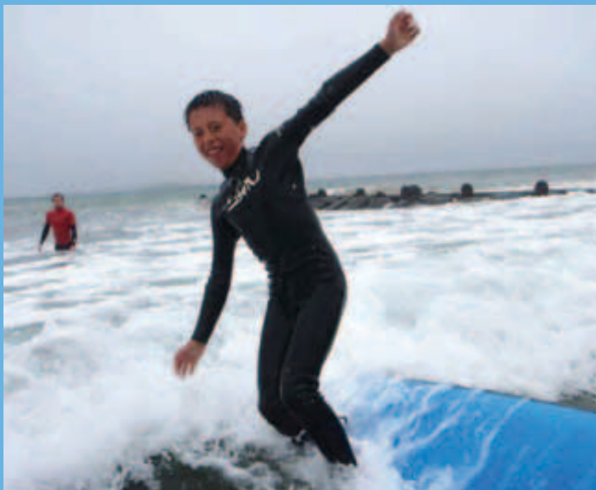
Cottage by the Sea – REEF Camps