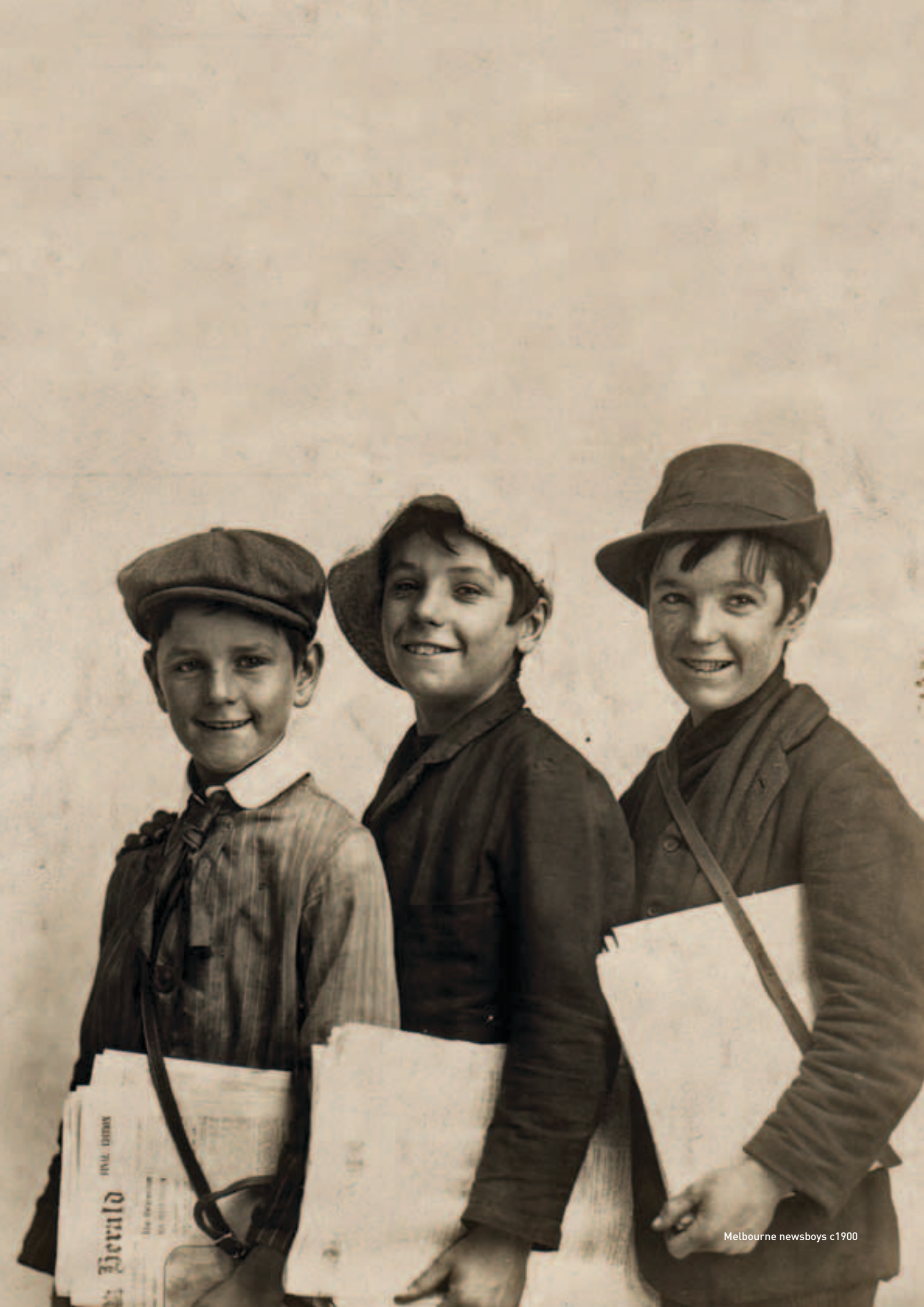
Melbourne newsboys c1900