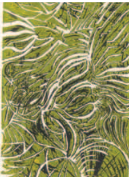
Melbourne Citymission – Evolution

Designed to provide children in the Adolescent Placement at Mallee Accommodation & Support Program with leadership and teamwork opportunities within a fun approach to learning. The program is located at Hattah, 50km south of Mildura in Victoria's north west Mallee region.