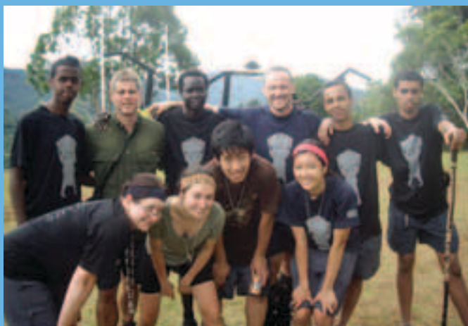
Above: Debney Park School – Kokoda Program