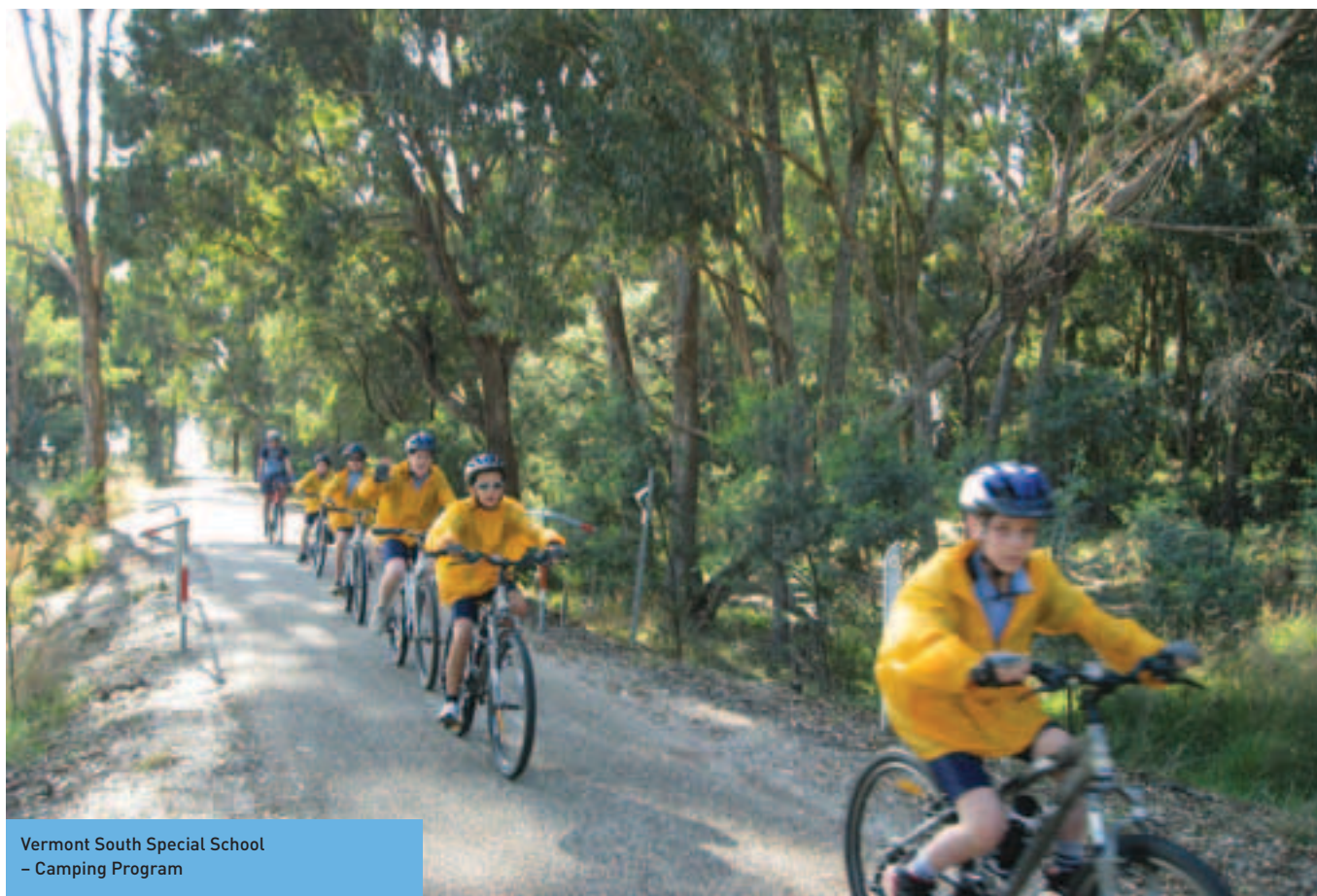
Vermont South Special School – Camping Program