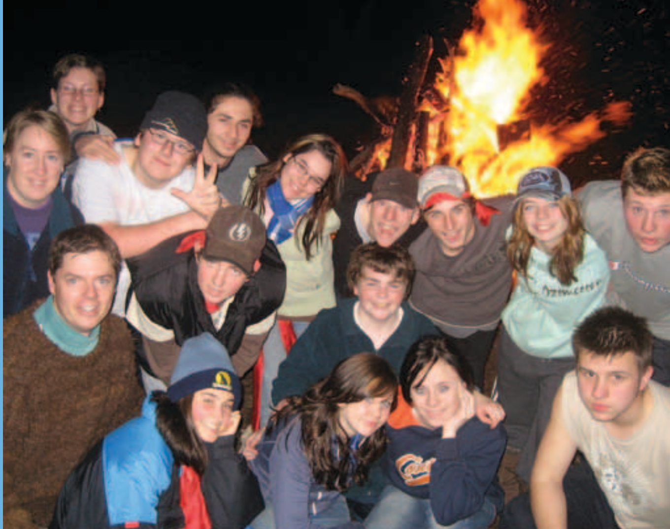
Breakaway Camps – School's OUT – Breakaway's IN