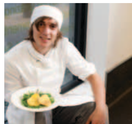
STREAT Ltd – Trainee at work

An intensive evidence-based support program for children who have witnessed or experienced serious violence. Programs can include, but are not limited to, individual, group or family counseling sessions and financial assistance to ensure children have school books, uniforms and dental and mental health check-ups. This innovative case management model works collaboratively with relevant agencies to facilitate recovery from trauma and negative adjustment to violence. The program also places an emphasis on connecting each child to their community in order to build the child's resilience.