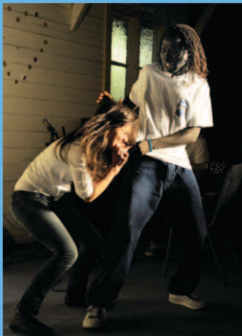
Right: Western Edge Youth Arts – PLAY