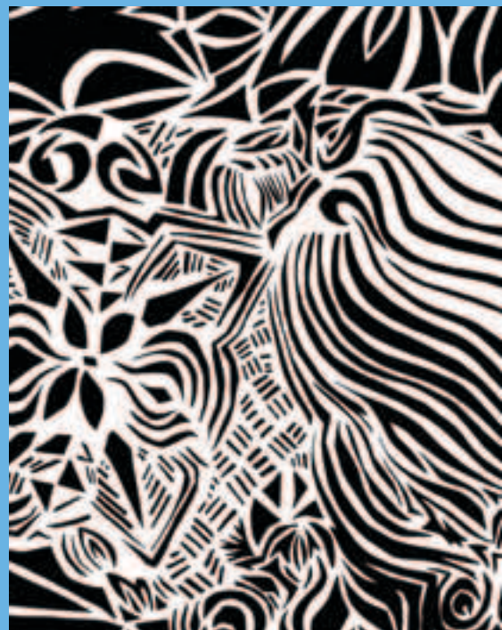
Melbourne Citymission – Evolution