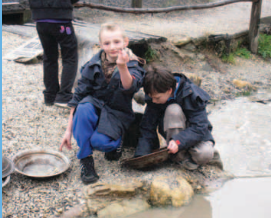
Vermont South Special School – Camping Program