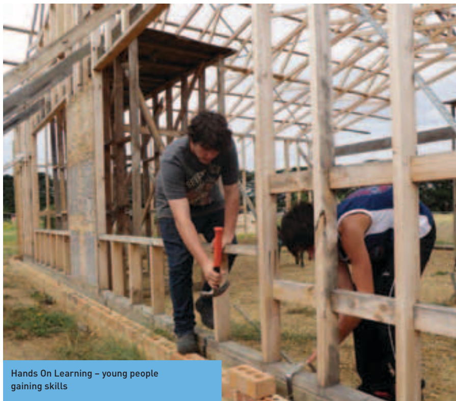
Hands On Learning – young people gaining skills