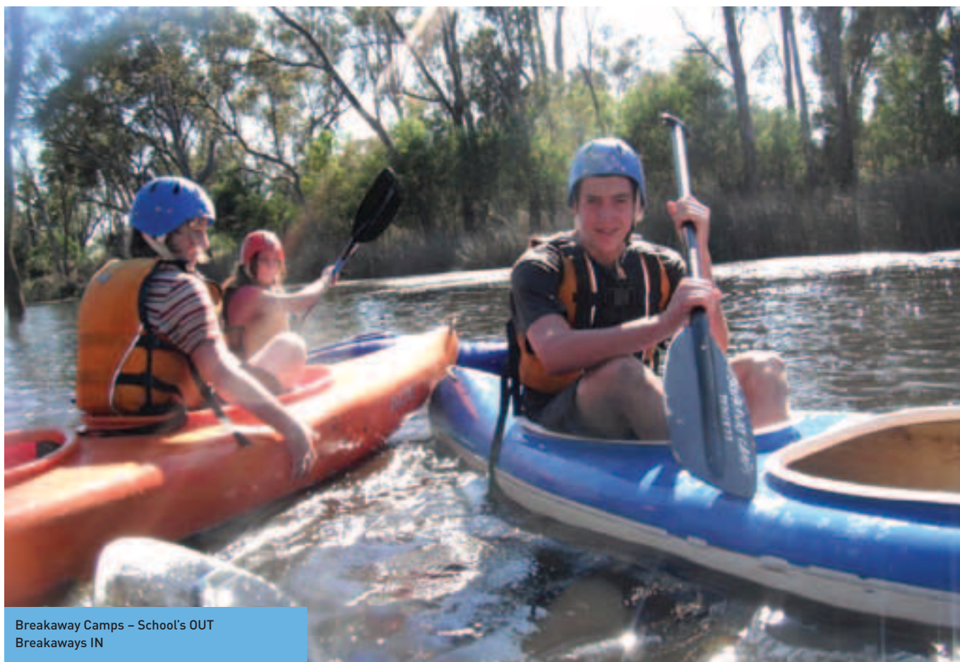
Breakaway Camps – School's OUT Breakaways IN