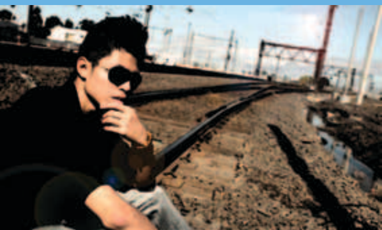
Black Hole Theatre – Lost in Transit