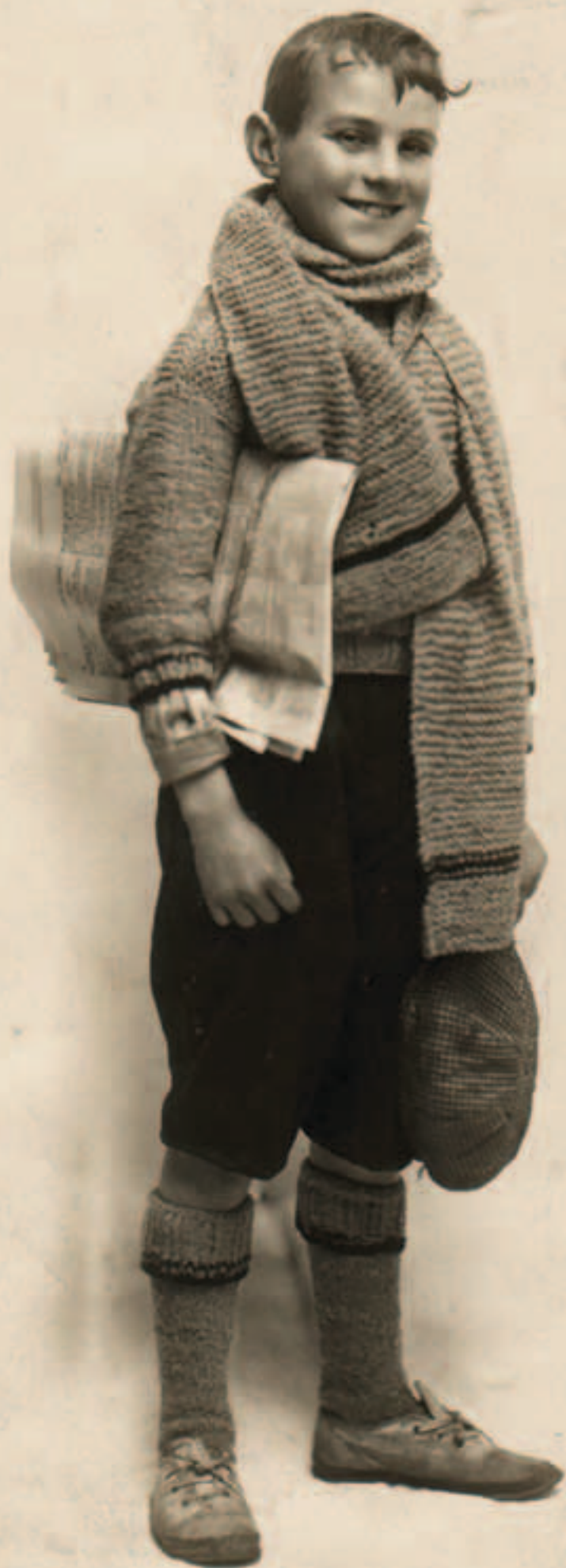
Melbourne newsboy c1920