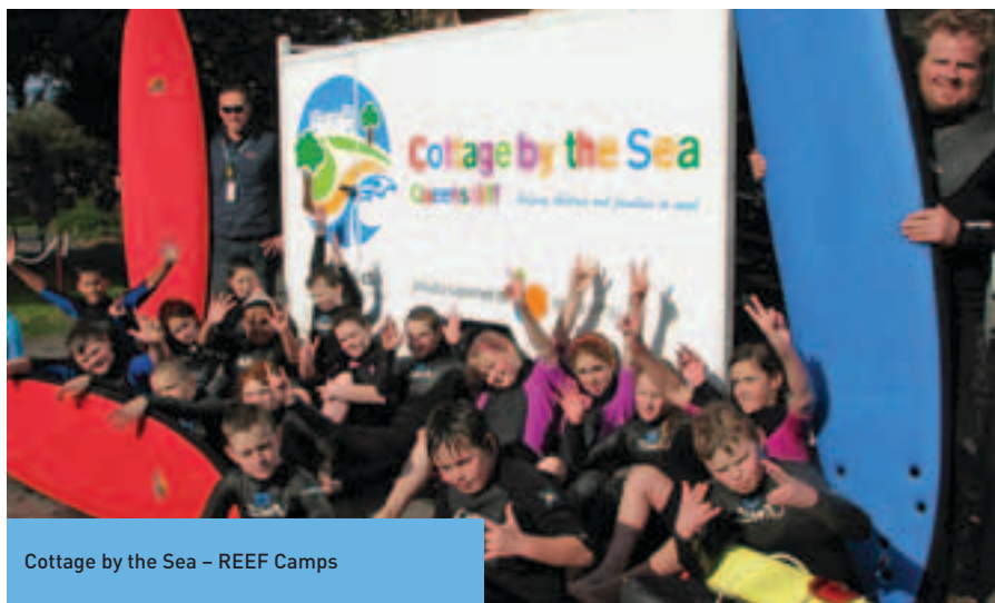
Cottage by the Sea – REEF Camps

REEF camps promote Respect, Education, Environment and Friendship and are designed to help participants develop self esteem, leadership skills and confidence, particularly during the transitional years from primary to secondary school.