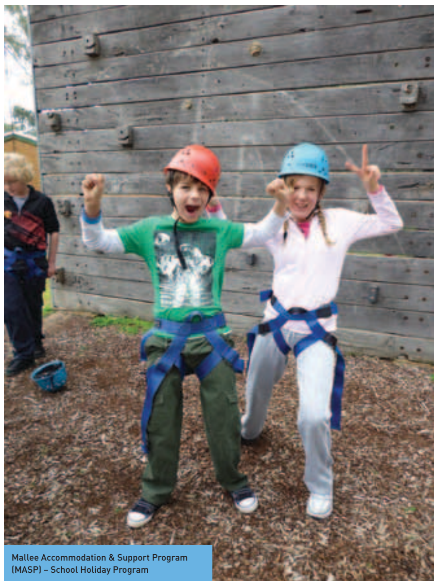
Mallee Accommodation & Support Program (MASP) – School Holiday Program