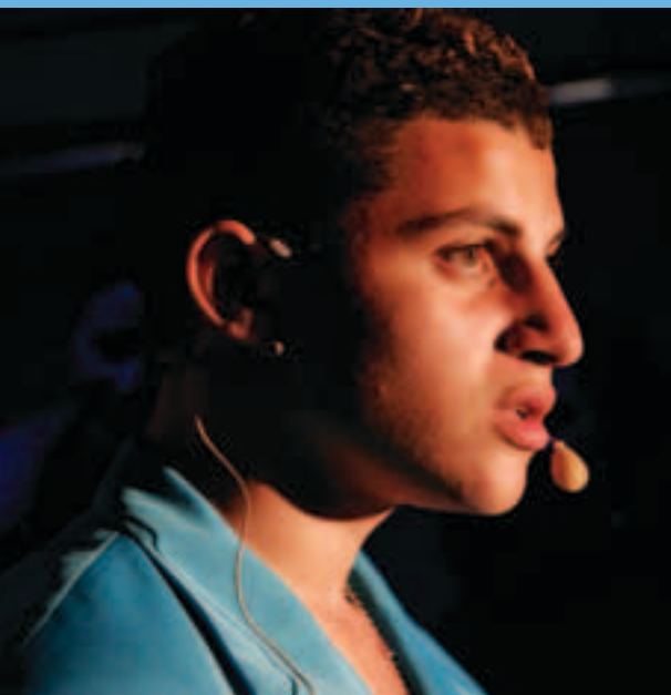
Anti-Racism Action Band (A.R.A.B) / Victorian Arabic Social Services – A.R.A.B Emerging Artists & Arts Workers Initiative