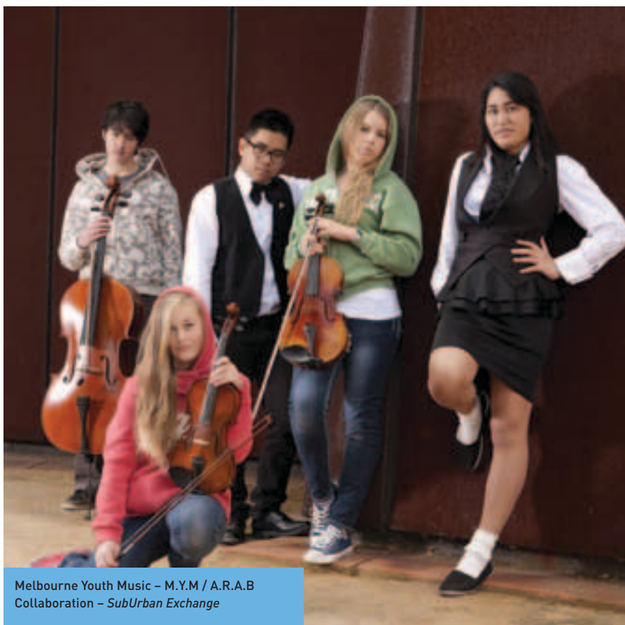
Melbourne Youth Music – M.Y.M / A.R.A.B Collaboration – SubUrban Exchange