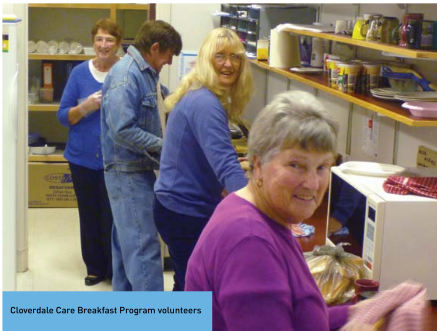
Cloverdale Care Breakfast Program volunteers