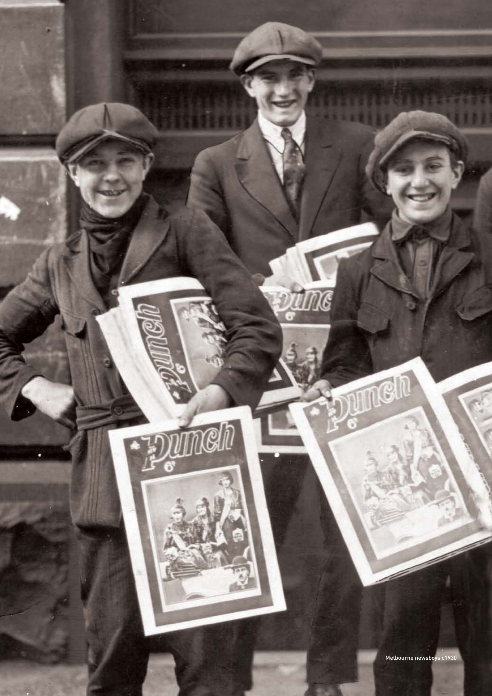
Melbourne newsboys c1930