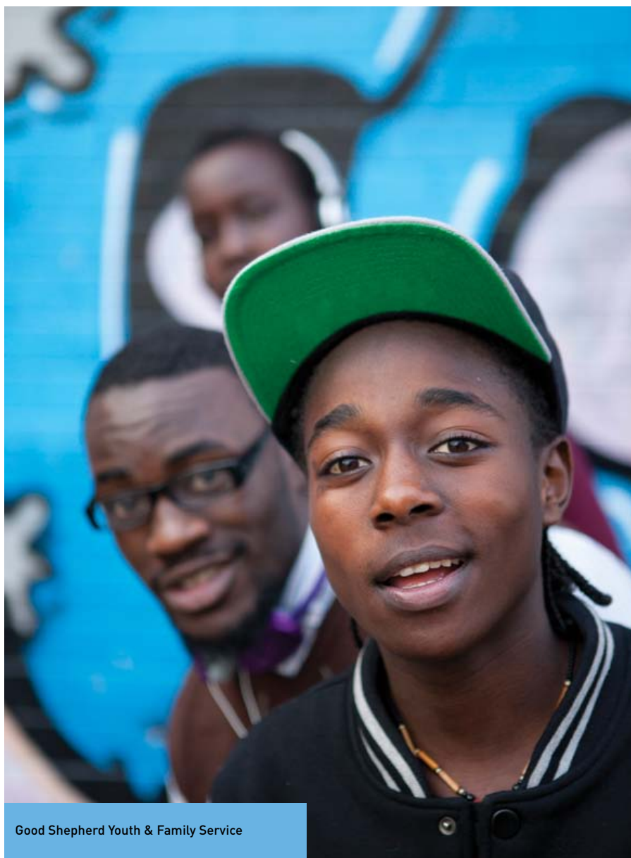
Good Shepherd Youth & Family Service