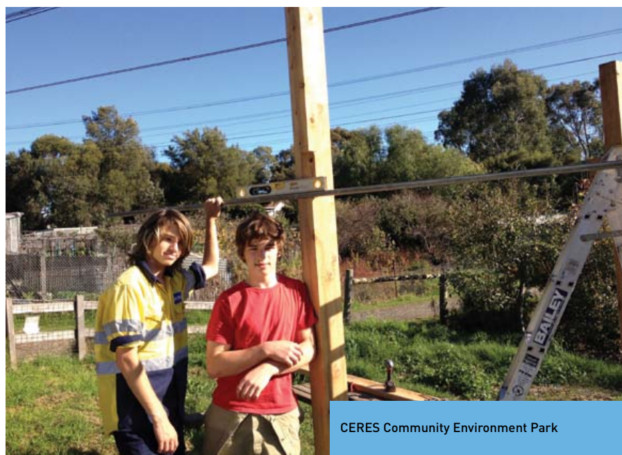
CERES Community Environment Park

CERES (Centre for Education and Research in Environmental Strategies) is a 10-acre community environment park alongside Merri Creek in East Brunswick. An 'urban oasis', CERES includes an education and training program, organic café, permaculture and bush-food nursery, organic market and shop, restaurant, organic farm, multi-cultural education village and renewable energy and water efficiency displays. Students at risk of leaving school prematurely