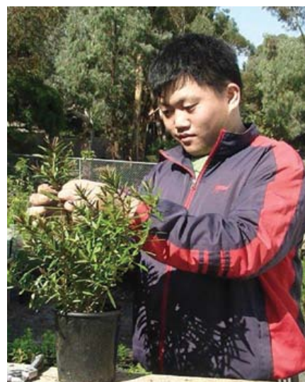
Kevin Heinze Centre Inc.