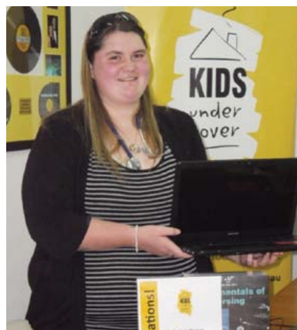
Kids Under Cover