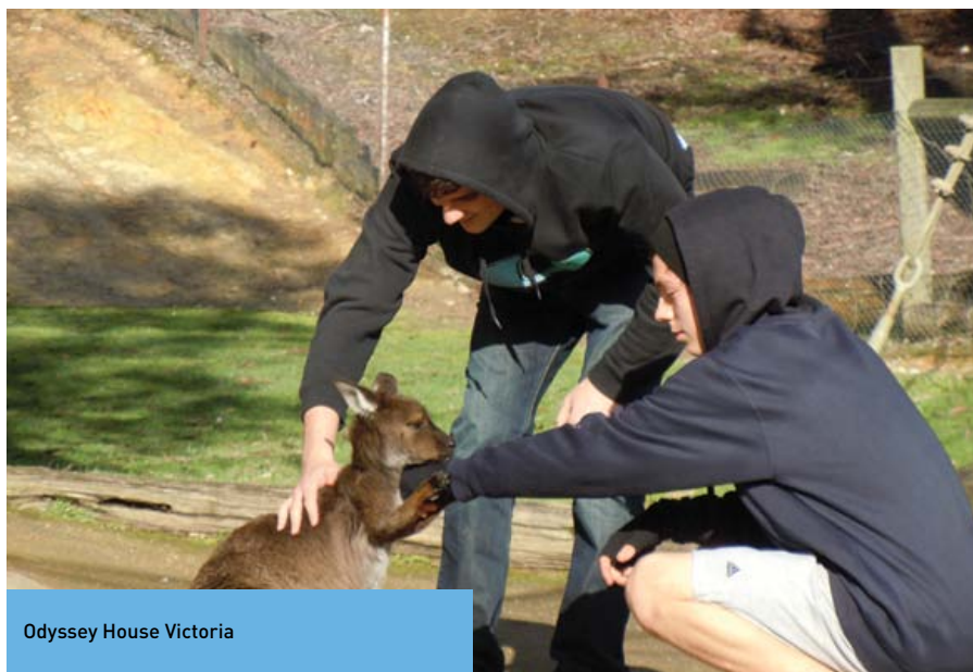
Odyssey House Victoria

Summer school holiday activities for young people. The activities encourage teamwork and positive social relationships.