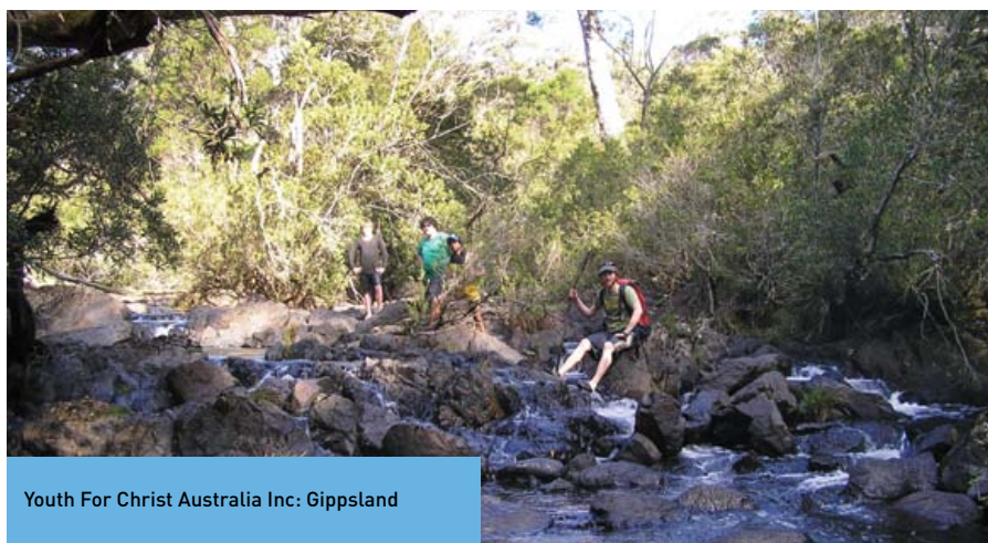
Youth For Christ Australia Inc: Gippsland

The project harnesses rugby as a way of re-engaging 15 teenagers in the greater Dandenong area in education and training. The teenagers are battling serious drug and alcohol issues. Four Melbourne Rebels rugby players will mentor the youths and help them complete a Certificate II Sport and Recreation traineeship.