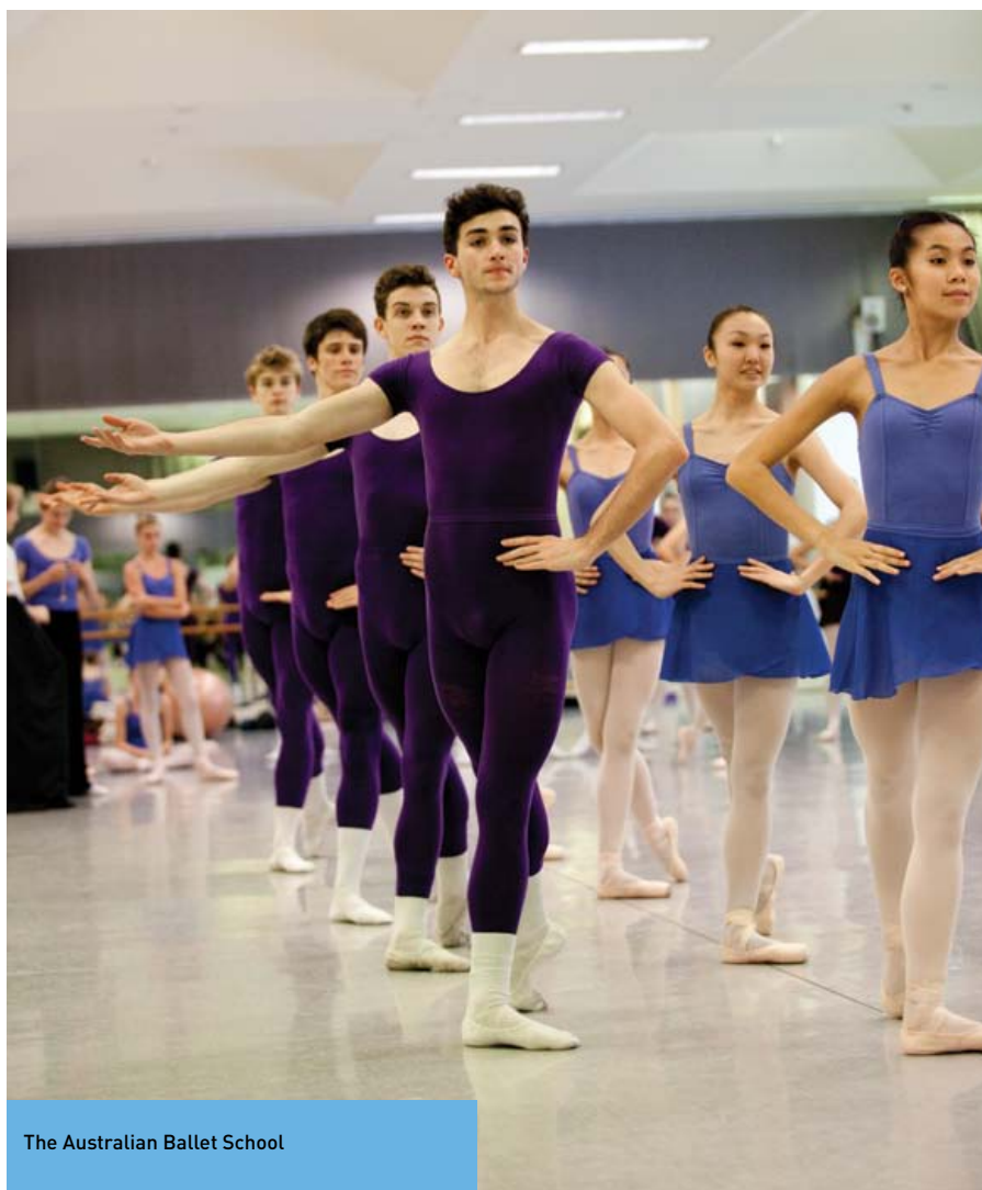
The Australian Ballet School