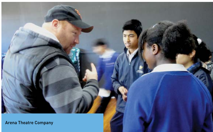
Arena Theatre Company

A program to support disadvantaged young people living at Banksia Gardens Estate. The youth workers help young people re-engage with education or move into training and employment.