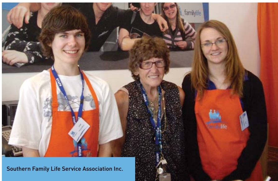
Southern Family Life Service Association Inc.

A camp, as part of an ongoing support program, for 14 to 18-year-olds, who are dealing with complex life issues, including learning difficulties and drug and alcohol misuse.