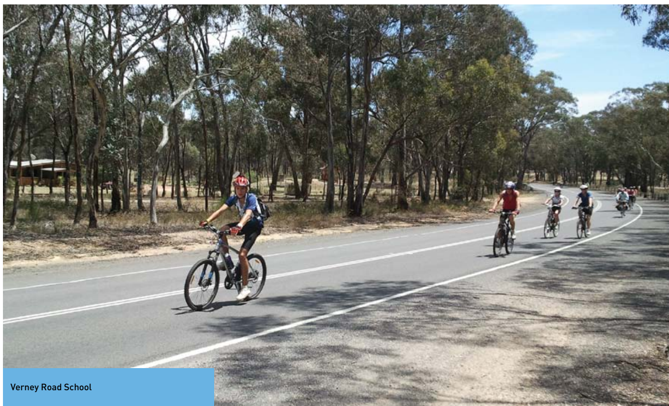
Verney Road School