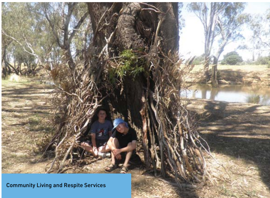
Community Living and Respite Services

A program to engage disadvantaged young men in education, training or employment and help them develop a positive relationship with their family and the wider community. Activities include a 12-day bush hike in the King Valley. There is follow-up support for participants and their families for two years.