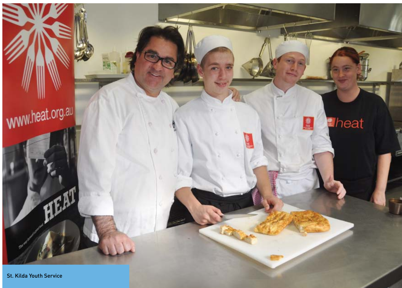
St. Kilda Youth Service