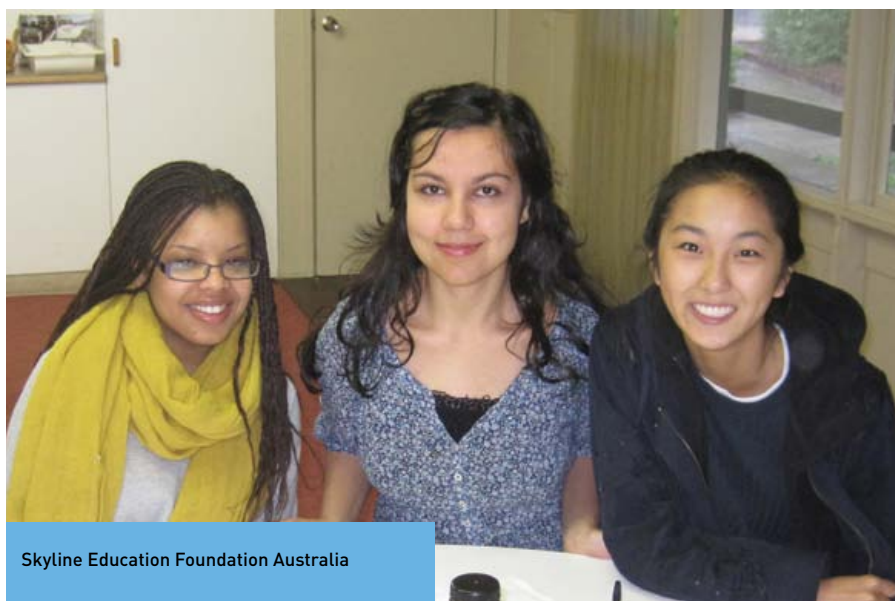
Skyline Education Foundation Australia